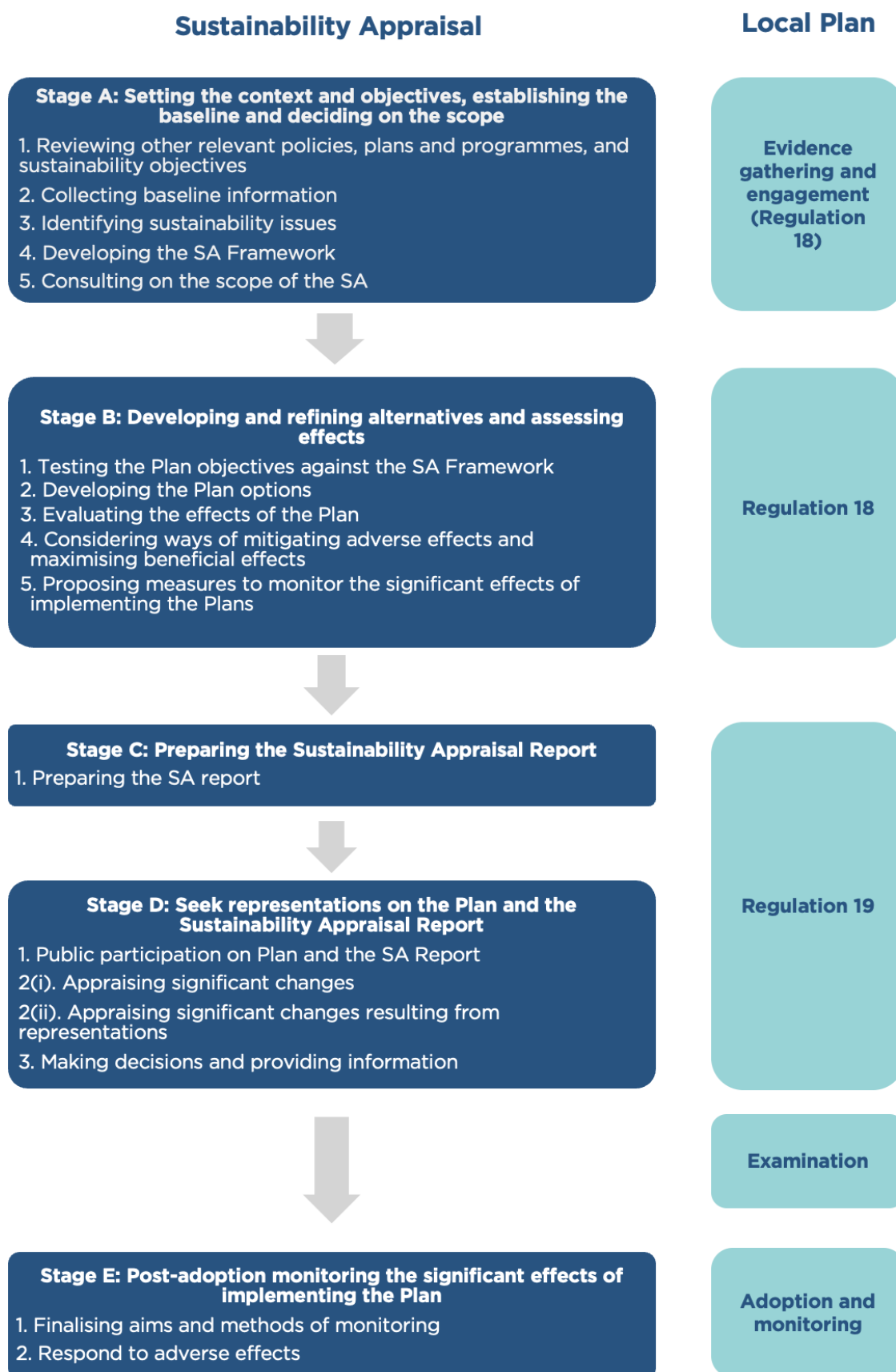
Figure 1.2: Sustainability appraisal process