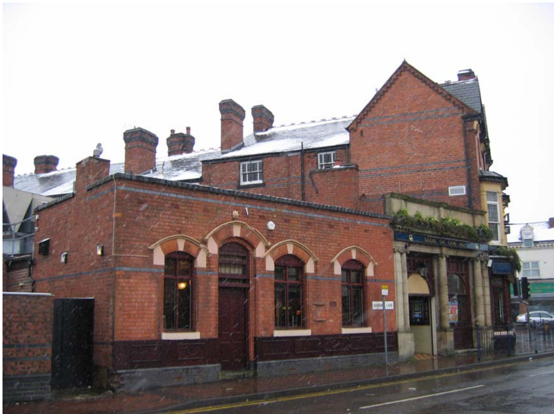
Plate 22: Single-storey Windmill Lane elevation of the former Seven Stars public house