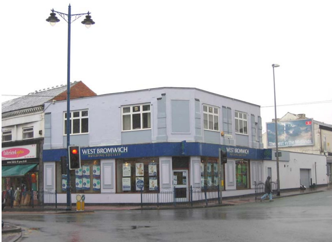
Plate 18: The West Bromwich Building Society building (No. 26 Cape Hill, corner with Shireland Road)