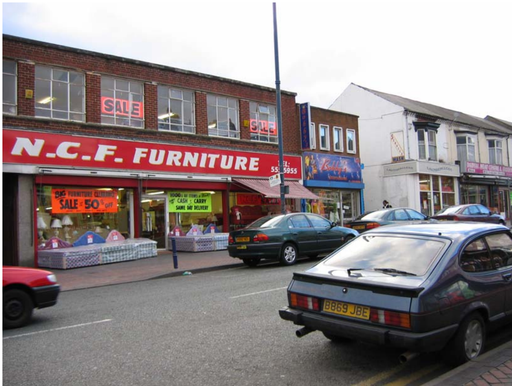
Plate 31: The premises of N.C.F. Furniture, Cape Hill