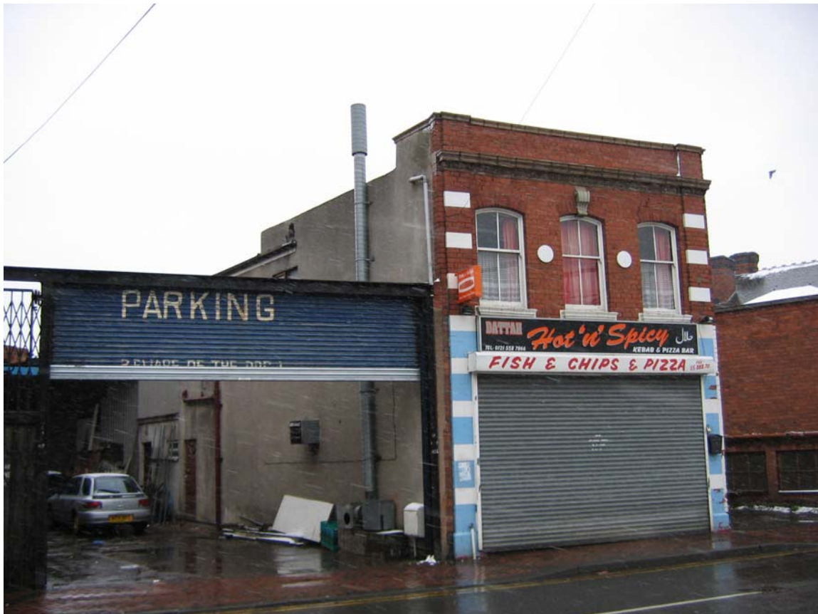
Plate 24: No. 106 Windmill Lane