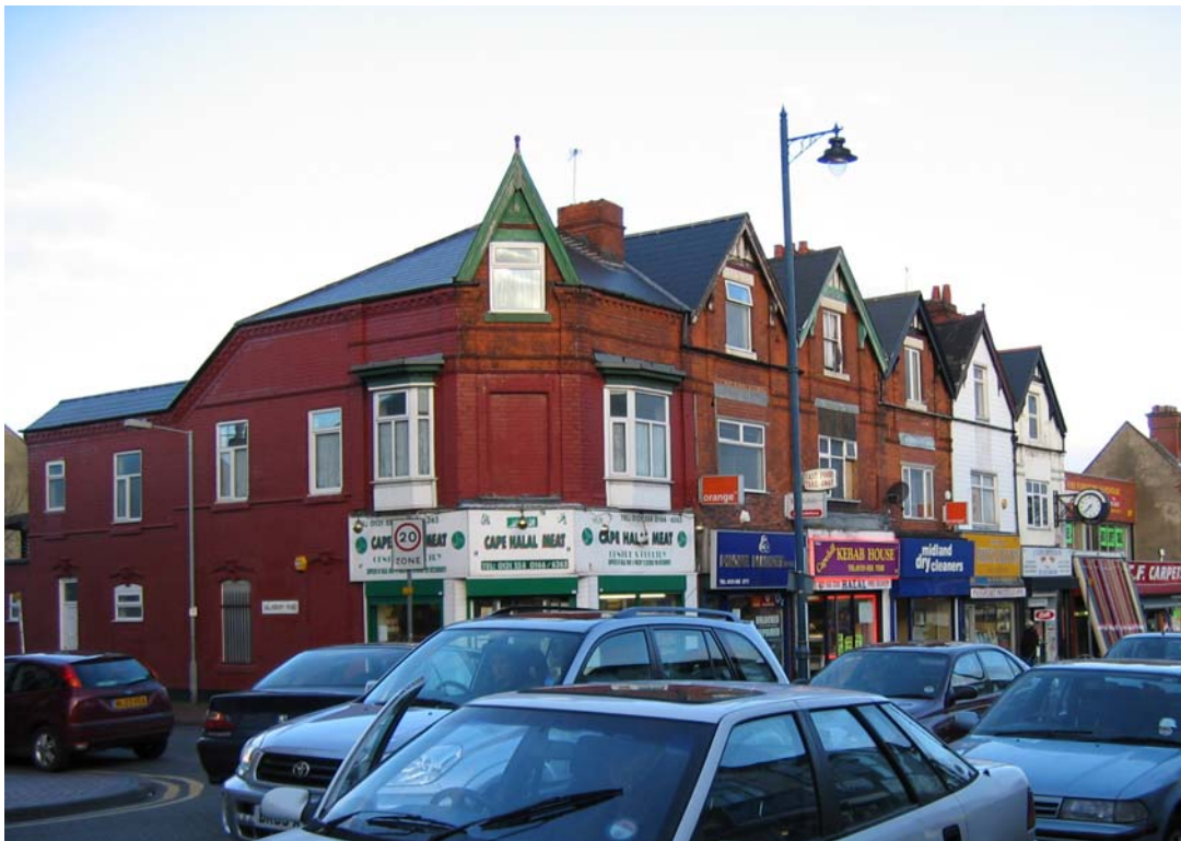
Plate 10: Nos.69-79 Cape Hill