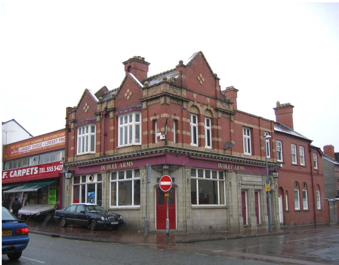
Plate 12: The Dudley Arms on the corner of High Street and Roseberry Road