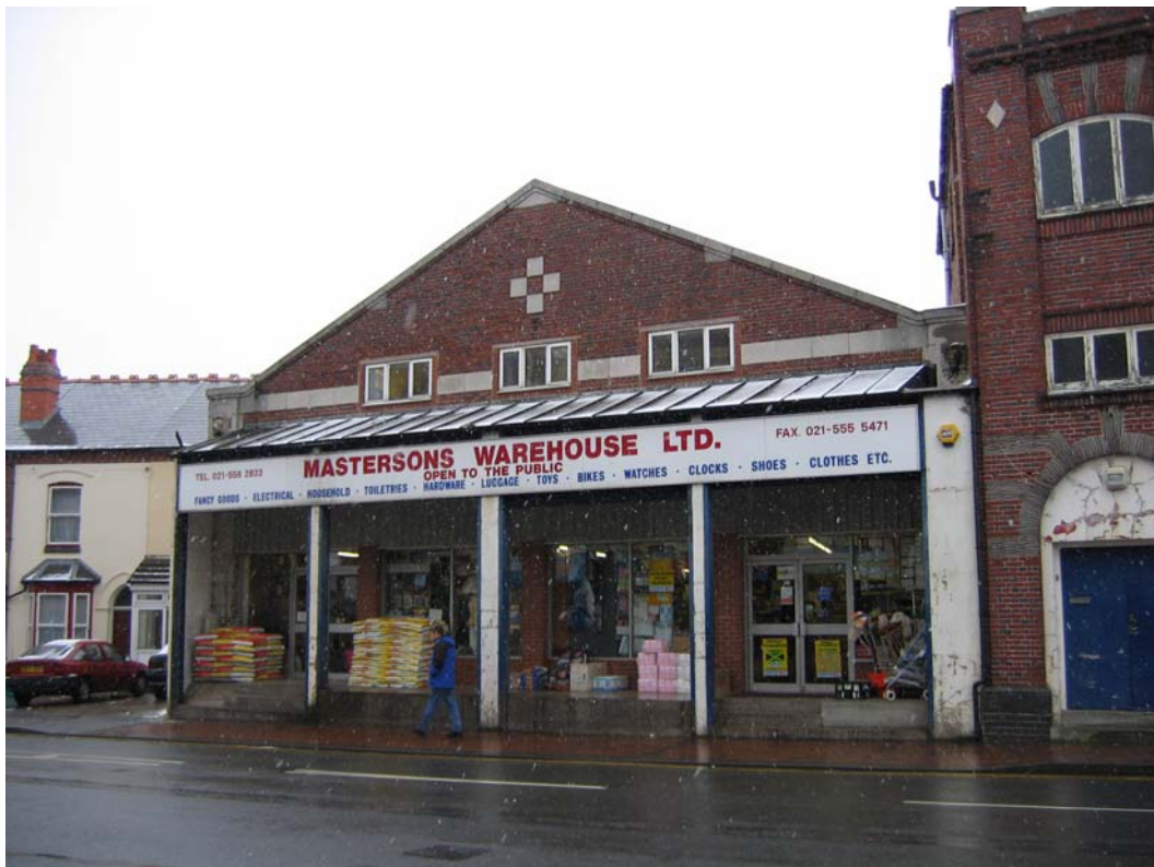
Plate 26: 1930s addition to No. 105 Windmill Lane