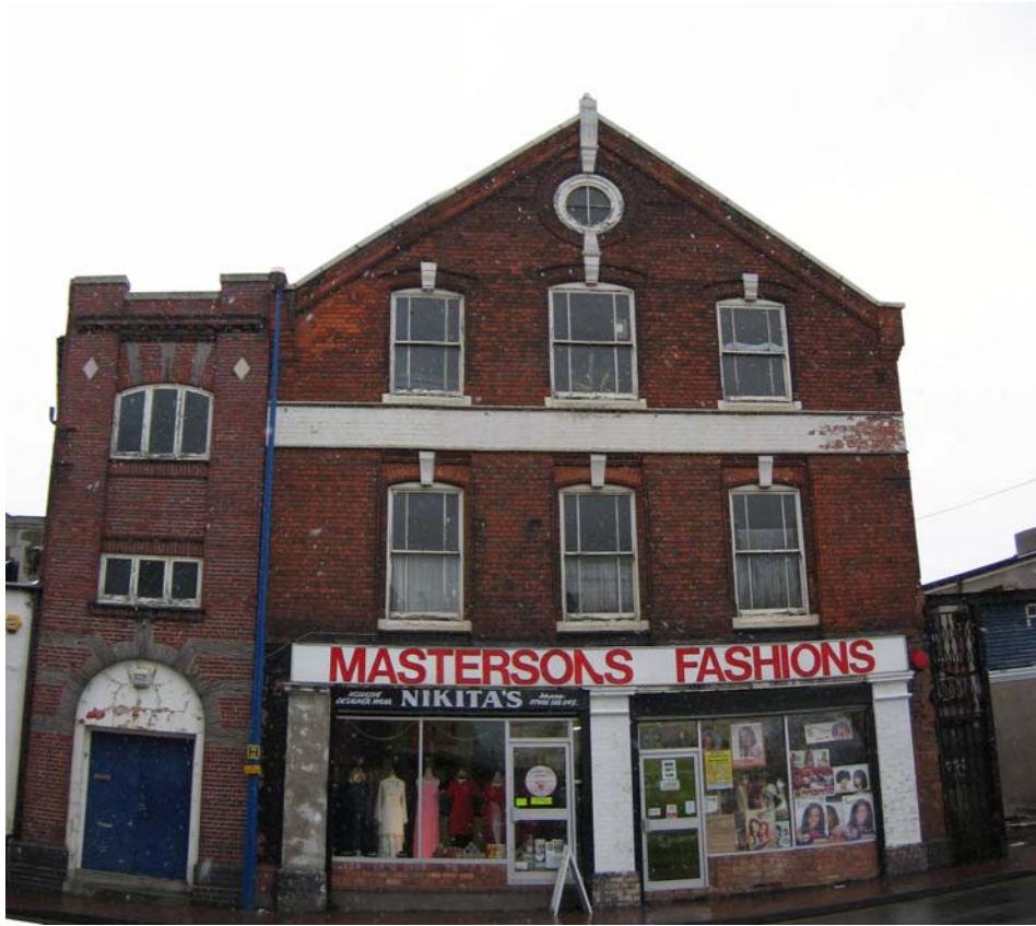
Plate 25: No. 105 Windmill Lane