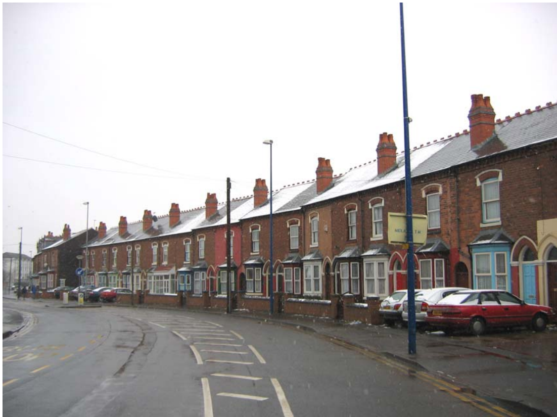
Plate 28: Late 19 th -century terrace on Windmill Lane