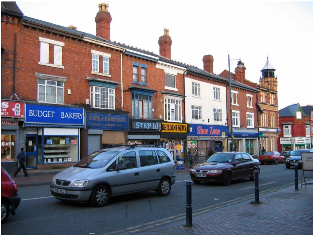
Plate 8: Nos. 51-65 Cape Hill