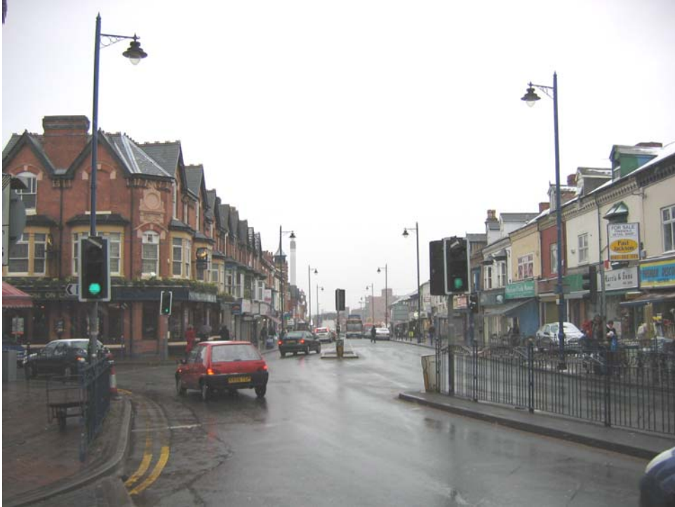
Plate 1: Long-distance view eastwards down Cape Hill from its junction with Shireland Road