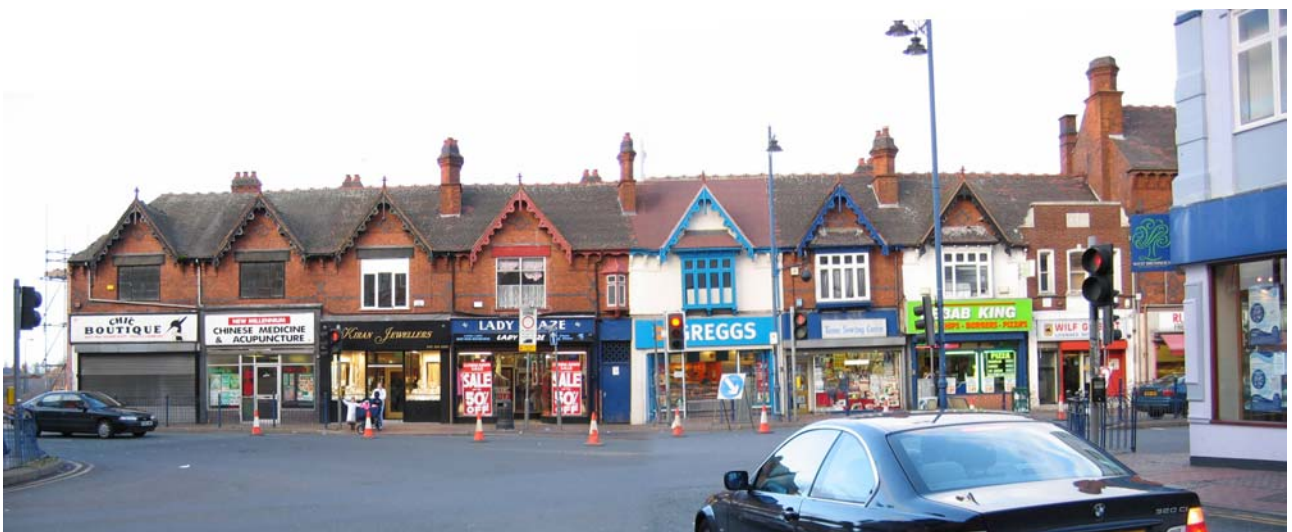
Plate 4: Nos. 17-31 Cape Hill (late 19 th -century)