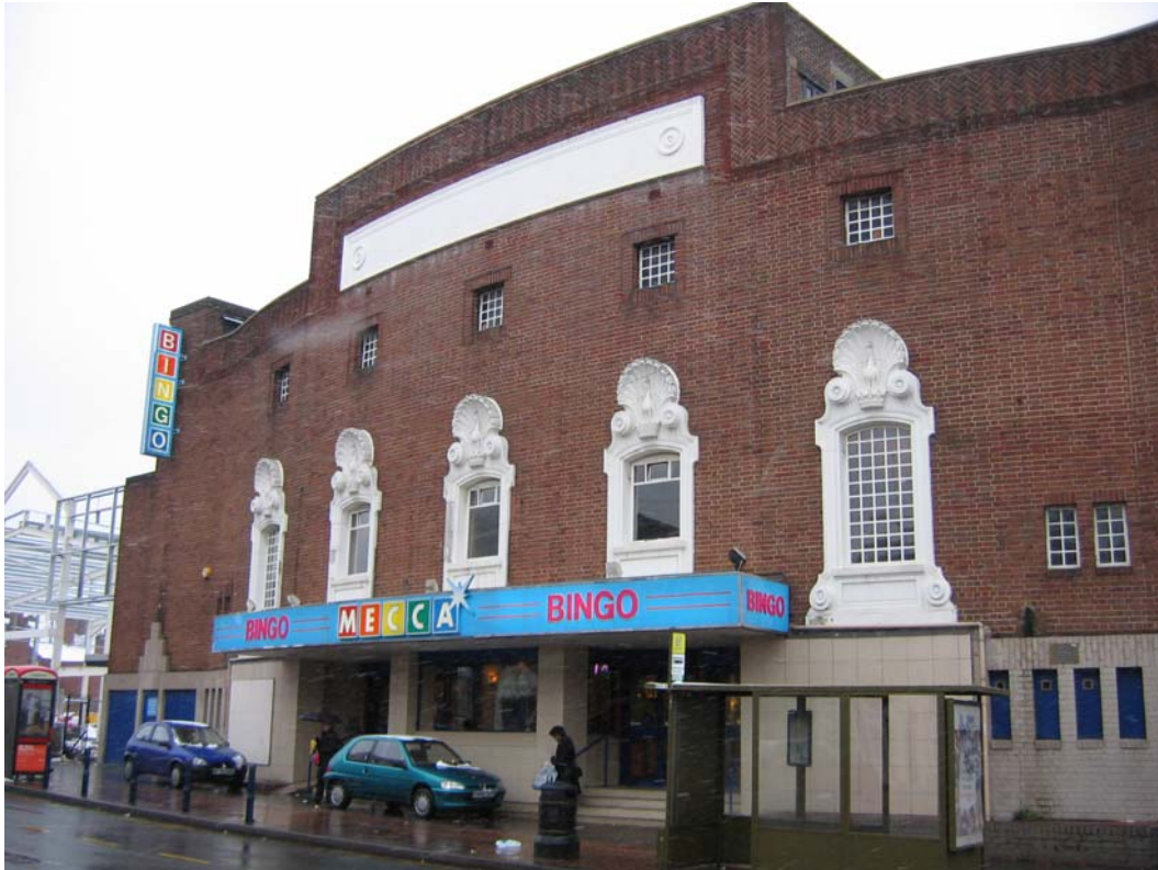
Plate 27: The Grade II listed former Rank Cinema, now a Mecca Bingo Hall, Windmill Lane