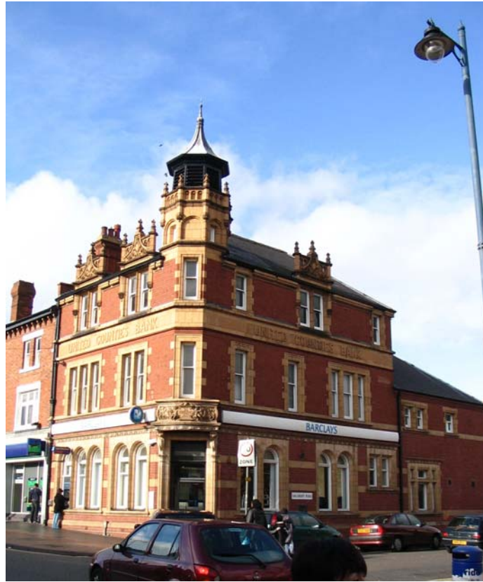
Plate 9: No.67 Cape Hill, originally the United Counties, now Barclay's Bank