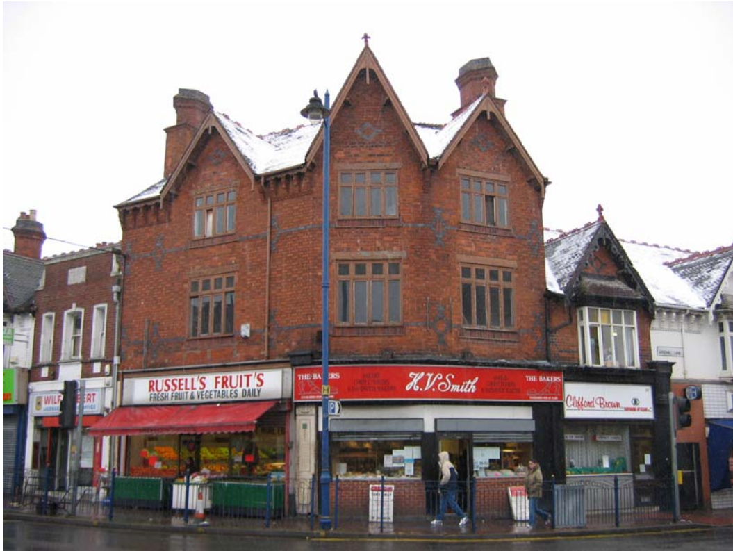
Plate 5: 35-37 Cape Hill