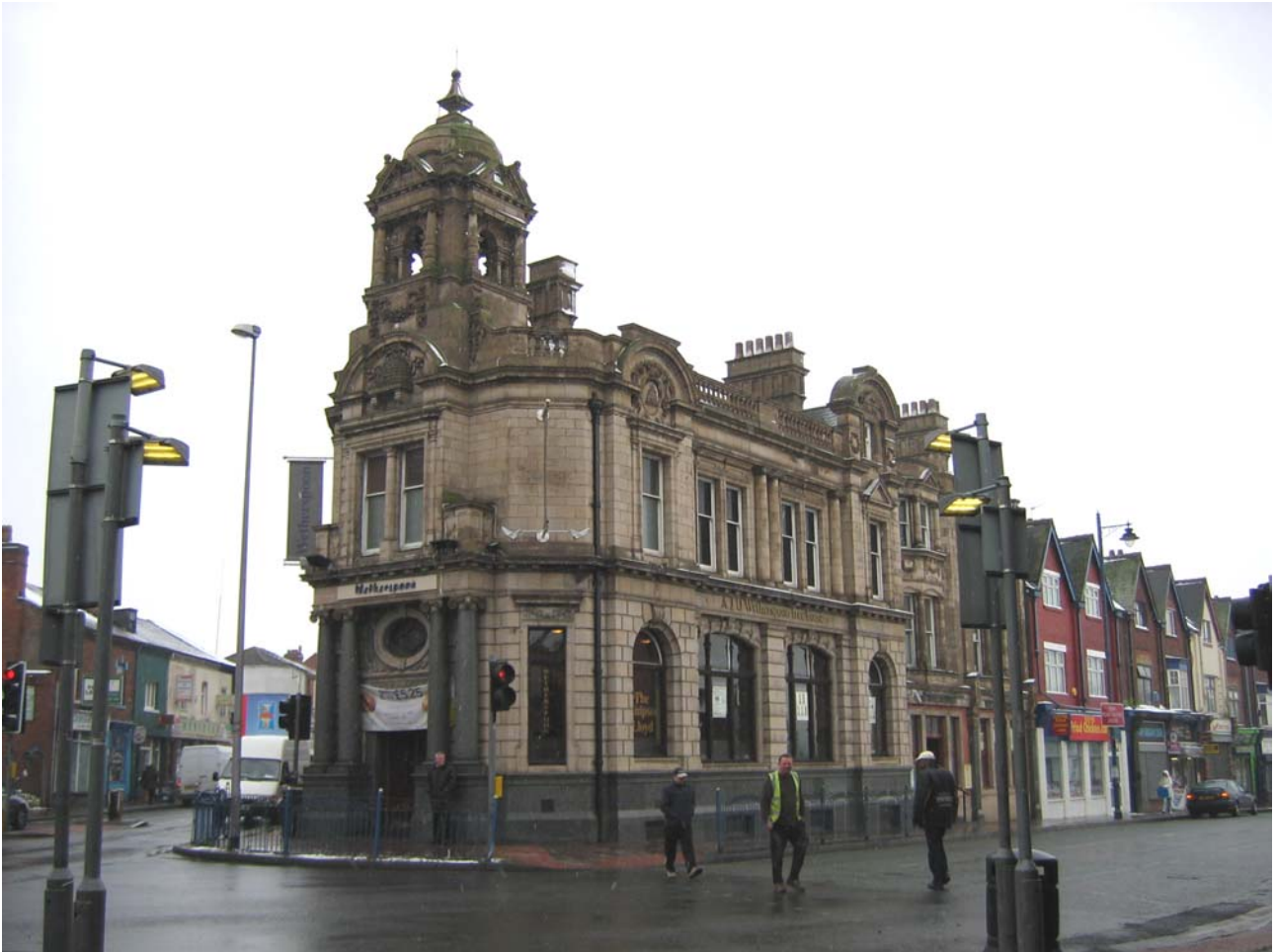
Plate 3: Nos.26 & 28 Cape Hill (the former Lloyds Bank)