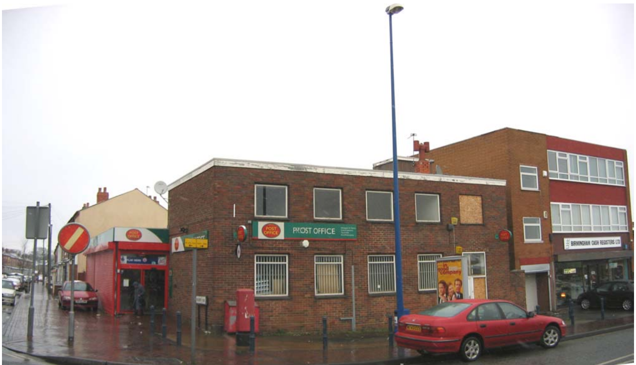
Plate 30: Post Office on corner of Roseberry Road