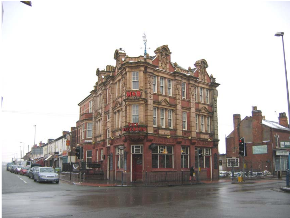
Plate 20: The Waterloo public house