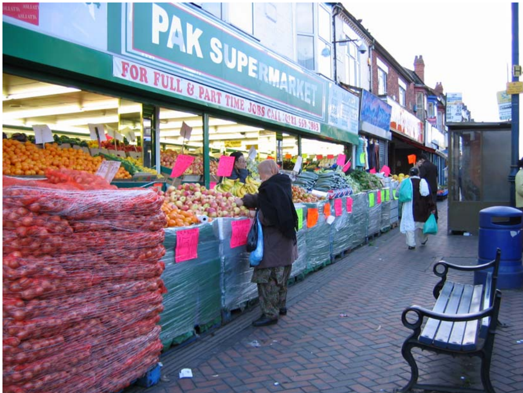
Plate 16: Colourful display outside Pak Supermarket on Cape Hill (Nos. 80-84)