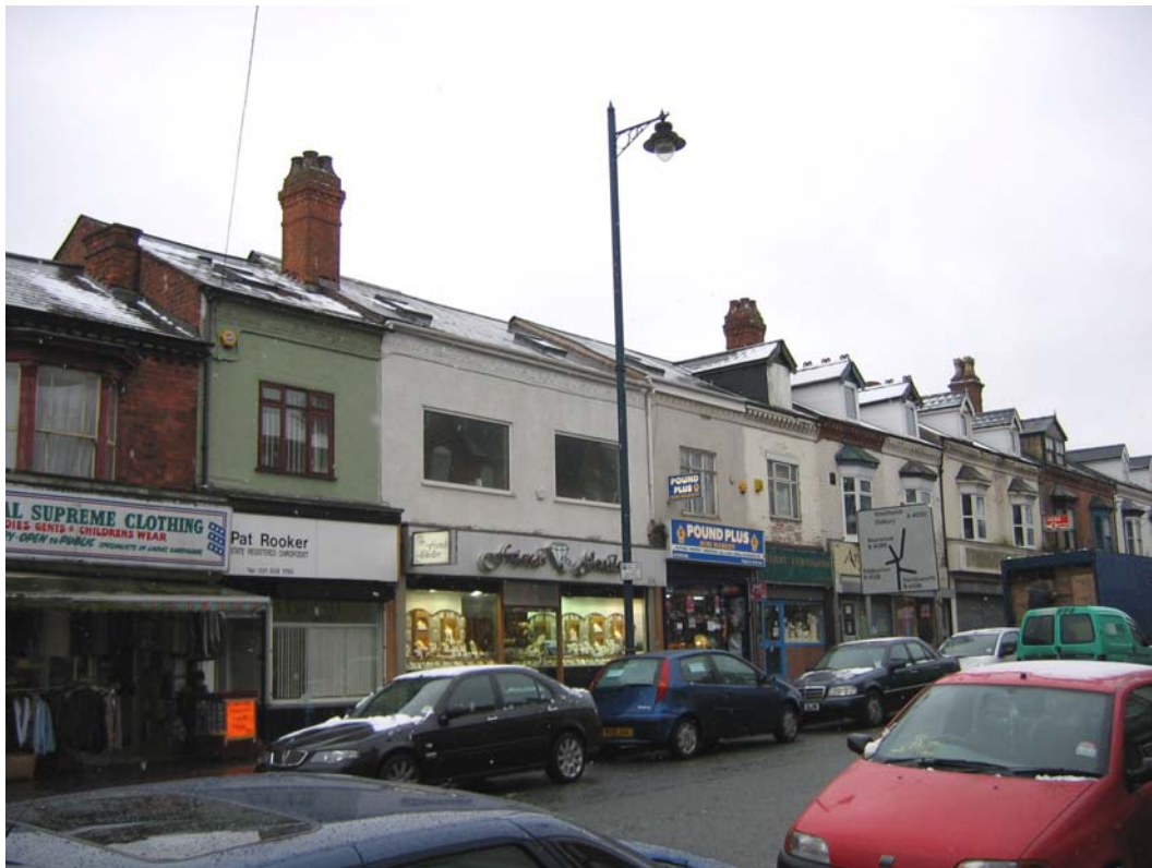
Plate 17: Nos. 28-66 Cape Hill