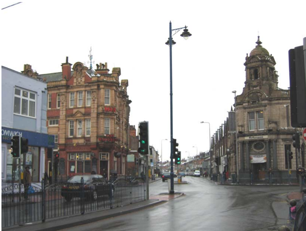
Plate 19: No. 26 Cape Hill, The Waterloo and the former Lloyds Bank building