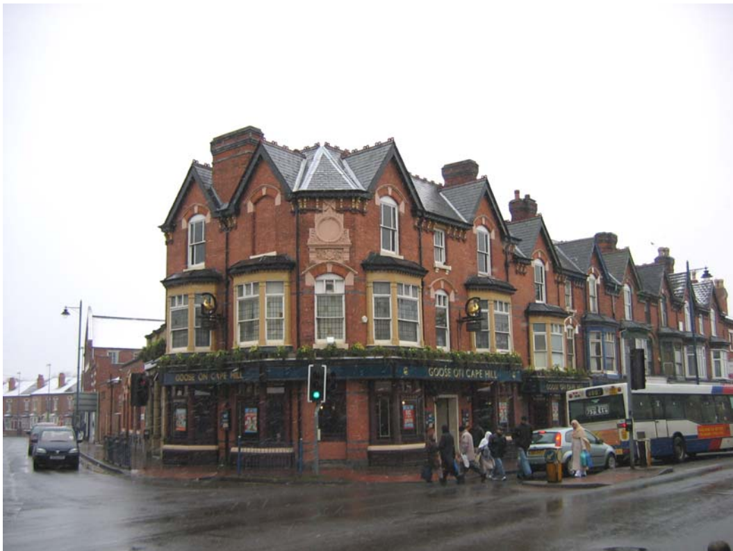
Plate 6: The former Seven Stars public house (recently renamed 'The Goose on Cape Hill')