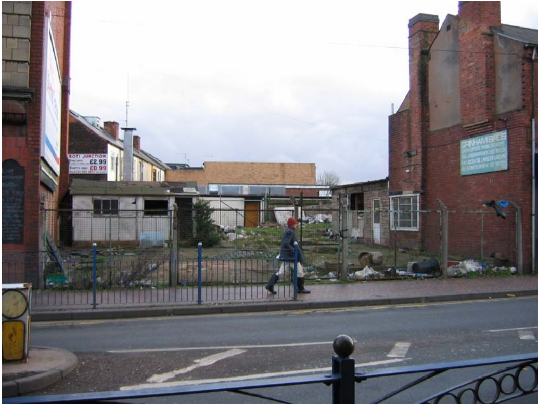
Plate 21: Vacant plot adjacent to The Waterloo public house on Cape Hill