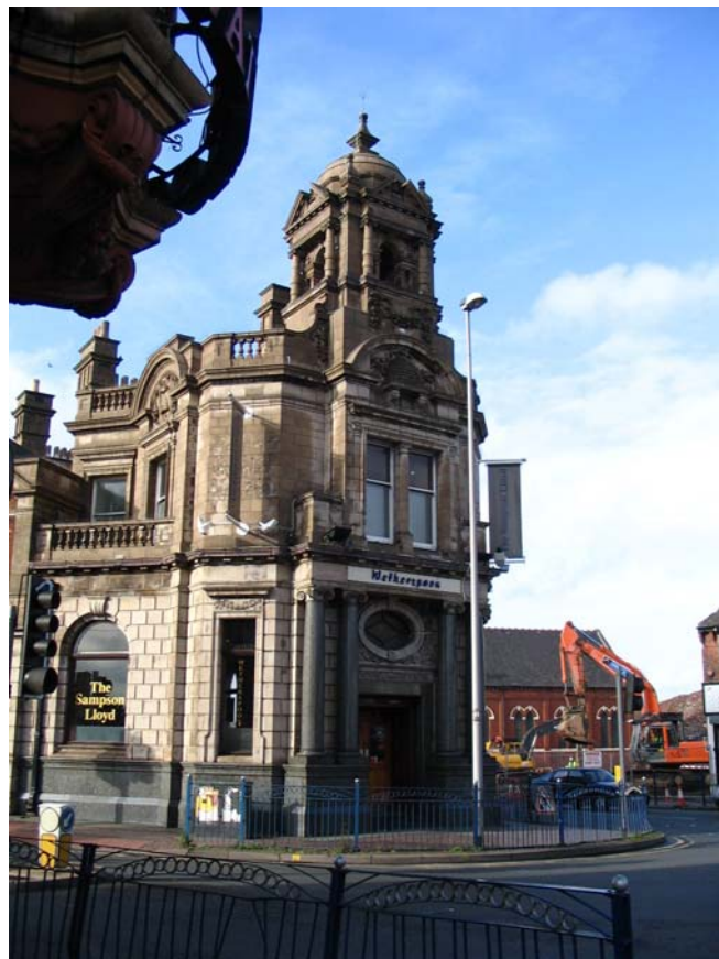
Plate 2: Nos.26 & 28 Cape Hill (the former Lloyds Bank), now converted into a Wetherspoon's pub, 'The Sampson Lloyd'