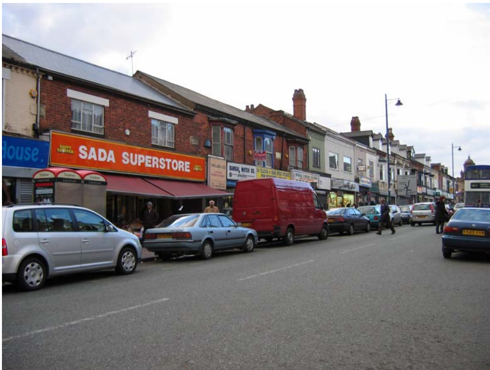
Plate 14: Nos. 68-76 Cape Hill, showing loss of the cornice and the bay windows above 'Sada Superstore' (Nos.74-76)