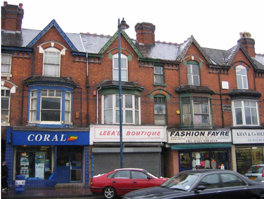
Plate 7: Nos. 41-45 Cape Hill