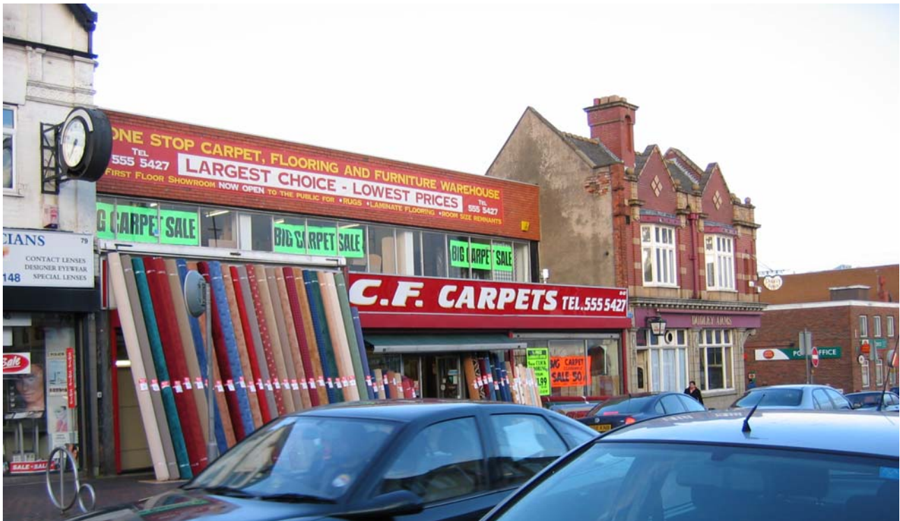
Plate 11: Nos. 81-87 Cape Hill and The Dudley Arms