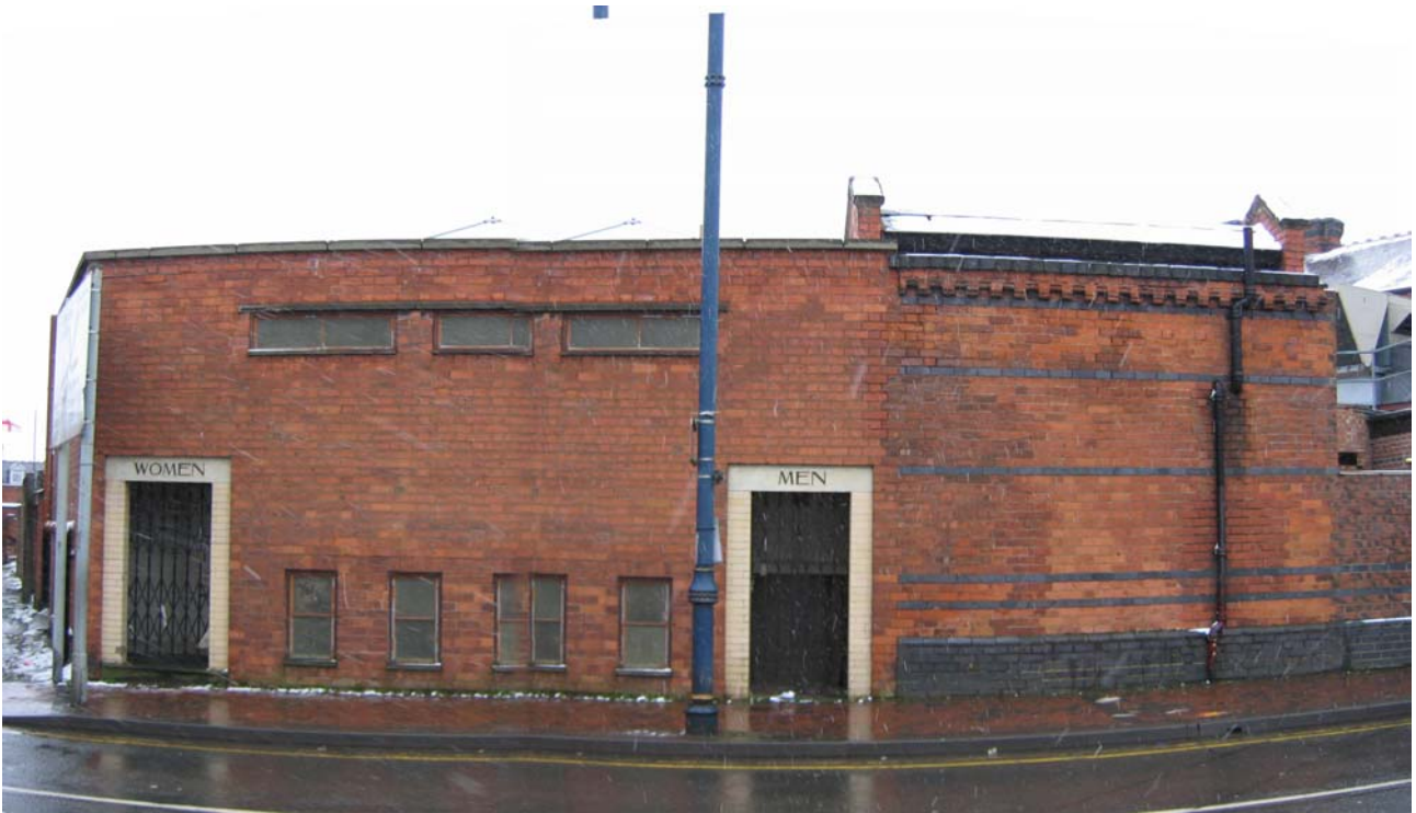
Plate 23: Outbuilding to the left of the passageway adjacent to the former Seven Stars public house, and the 1930s public toilets, Windmill Lane