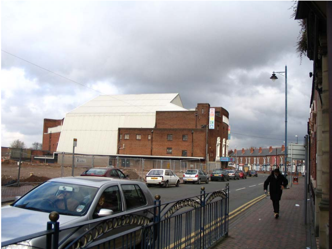
Plate 29: South elevation of the Mecca Bingo Hall, with adjacent redevelopment site