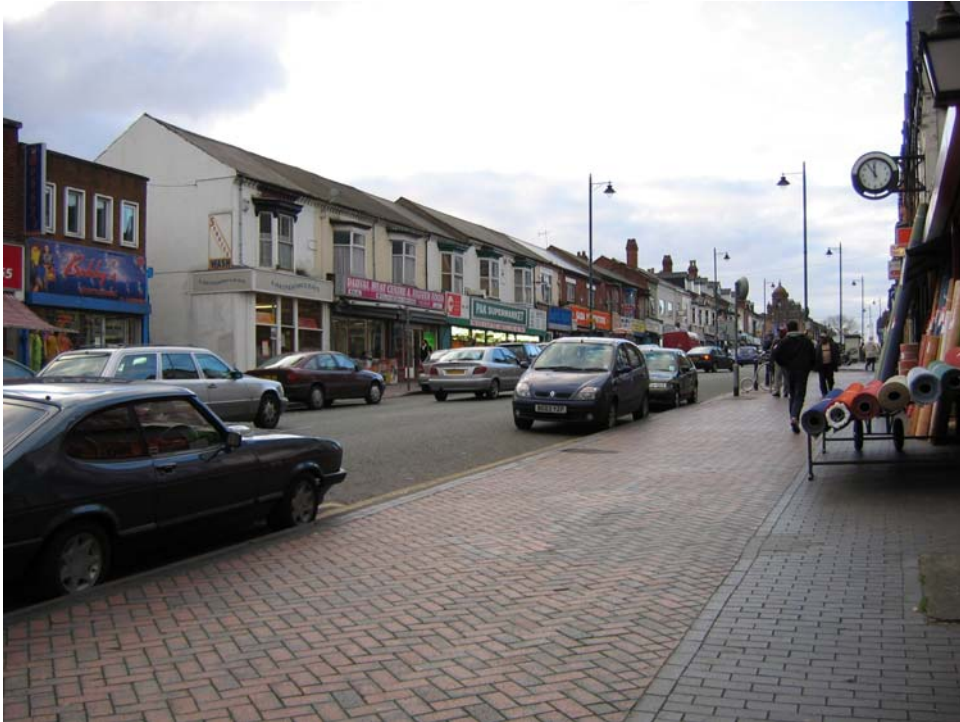
Plate 13: Nos. 68-90 Cape Hill on the left, and showing the projecting clock of No. 79 Cape Hill on the right