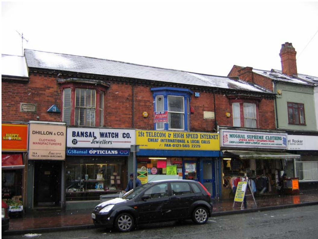
Plate 15: Nos.68-72 High Street, showing original first-floor bay windows