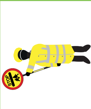
Figure C - Sign held up high - ready to cross pedestrians. Vehicles must stop unless unsafe to do so.