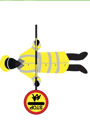
Figure B - Sign sideways - Barrier to prevent pedestrians crossing. Not ready to cross pedestrians