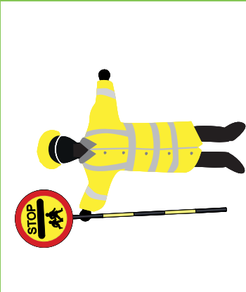
Figure D - Sign held up high - All drivers must stop