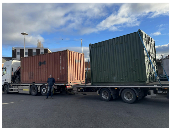
February 2024 - Storage containers arrive at CHCL to help facilitate learning to ride, led bike rides and their bike repair shop

To help support the bicycle project Sandwell's air quality team encouraged the centre to apply for Vision 2030 Community Grant, which they were successfully awarded in December 2023. This has enabled the centre to purchase two shipping containers. One will be used as a bicycle store allowing children and adults without access to a bicycle to learn to ride and build confidence riding, the other will be used as a cycling repair hub.