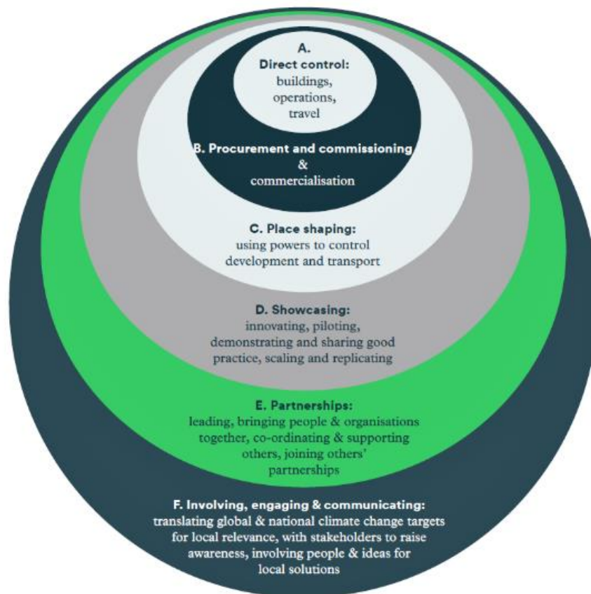
Figure 1: Spheres of local authority influence over emissions 14