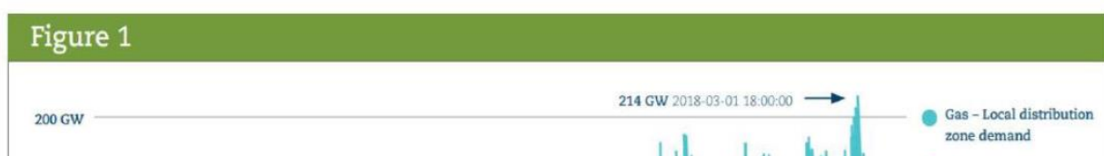
Yearly Gas and Electricity demand

The graph below shows just how much gas we use in the UK, mainly for space heating, and therefore the challenge involved in replacing that gas with other forms of energy. We need to significantly increase the amount of energy we generate from electricity, as so much of our heat comes from gas.